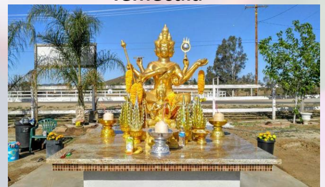
33170 Leon Rd, Winchester, CA 92596 Facebook